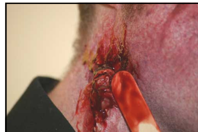
...to the blood being applied.

- For a hollow eyed look, pull down the lower eyelids using silk or fishskin/goldbeaters skins- glue with prosaide. Apply adhesive to the skin below the eye and a small piece of material- allow both to dry. Apply one end of the material to the adhesive below the eye, pull down & attach.