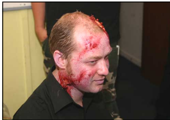
The final zombie look, including shading, gaping neck and head wounds, blackened teeth, pale lips, etc, created with some basic make up and things from YOUR kitchen.