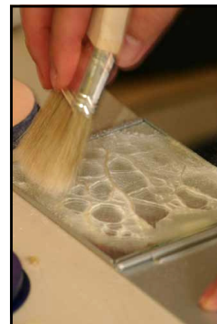
How to make your 'chunks o' flesh'... The first image shows the latex pulled over the mirror and then rubbed to create the cob-web look, the second image shows the powder applied and the third image show the 'chunks' prior to be being removed and applied to either the face or body or your lucky Zombie!