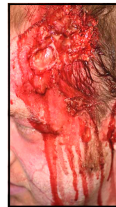
Bloody Head Wound

Mix maple syrup with red, blue & yellow food colour until you get the right colour. It can be darkened to look like aged blood with liquid gravy browning. You can also use golden syrup instead of maple syrup but will have to thin it down. Add some blood to hair gel to make a thickened blood gel. Fruit can be used if you need edible flesh. Watermelon works well cut into slices & covered with syrup blood, banana mixed with "blood" looks great dressed into wounds or for brains- quite nasty!