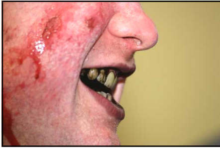
The blackened teeth, shown in close up.

stain. Dress any wounds with blood or the banana & blood dressing mentioned below, especially if you have created a soaped out head wound. A great finishing touch is latex "nernes" or "chunks o flesh" as named by Tom Savini. On a mirror, sheet of glass or flat surface paint a layer of latex or copydex. When it's dry, rub over the surface breaking holes in it until it looks like cobweb. Powder & peel off. This makes a great dressing for wounds, or for flesh pulled from a victim.