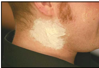
Neck Wound from initial latexing....

-Build up wounds using gelatine- 1tablespoon hot water, 1/4teaspoon glycerine. Add to 1 tablespoon of gelatine. Spread the liquid gelatine onto the skin; repeat as necessary to build up the desired amount. Once you have built up & it is set, stipple latex over to seal & help prevent the gelatine from drying out. Allow to dry. Now you can tear into this to make wounds. You can try adding breadcrumbs, oats or crushed branflakes to the mixture, or by pressing it on with a powder puff to add texture before covering with latex.